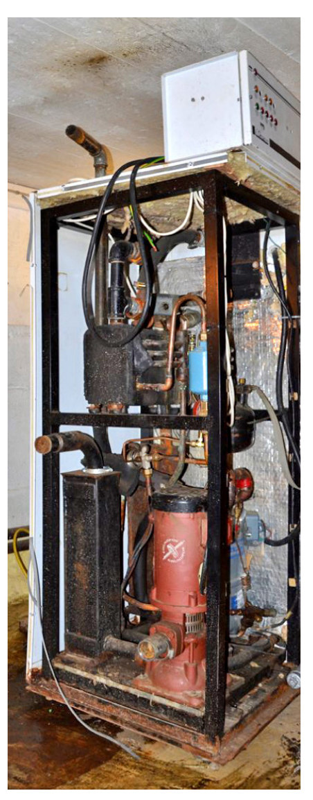
Thermia Duo 12 kW from 1983